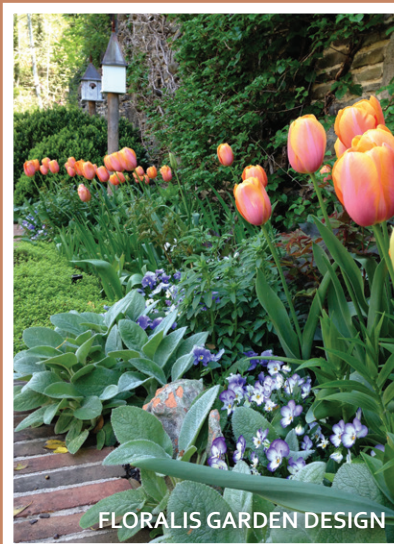
FLORALIS GARDEN DESIGN