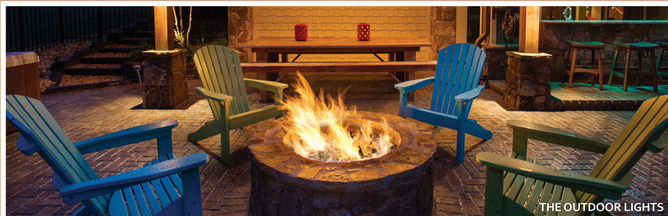
THE OUTDOOR LIGHTS