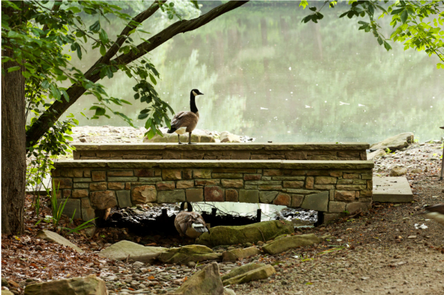
Smith – Ed Castro Landscape

This stone bridge provides an architectural accent where the creek meets the lake, allowing for pedestrian access along the water's edge.