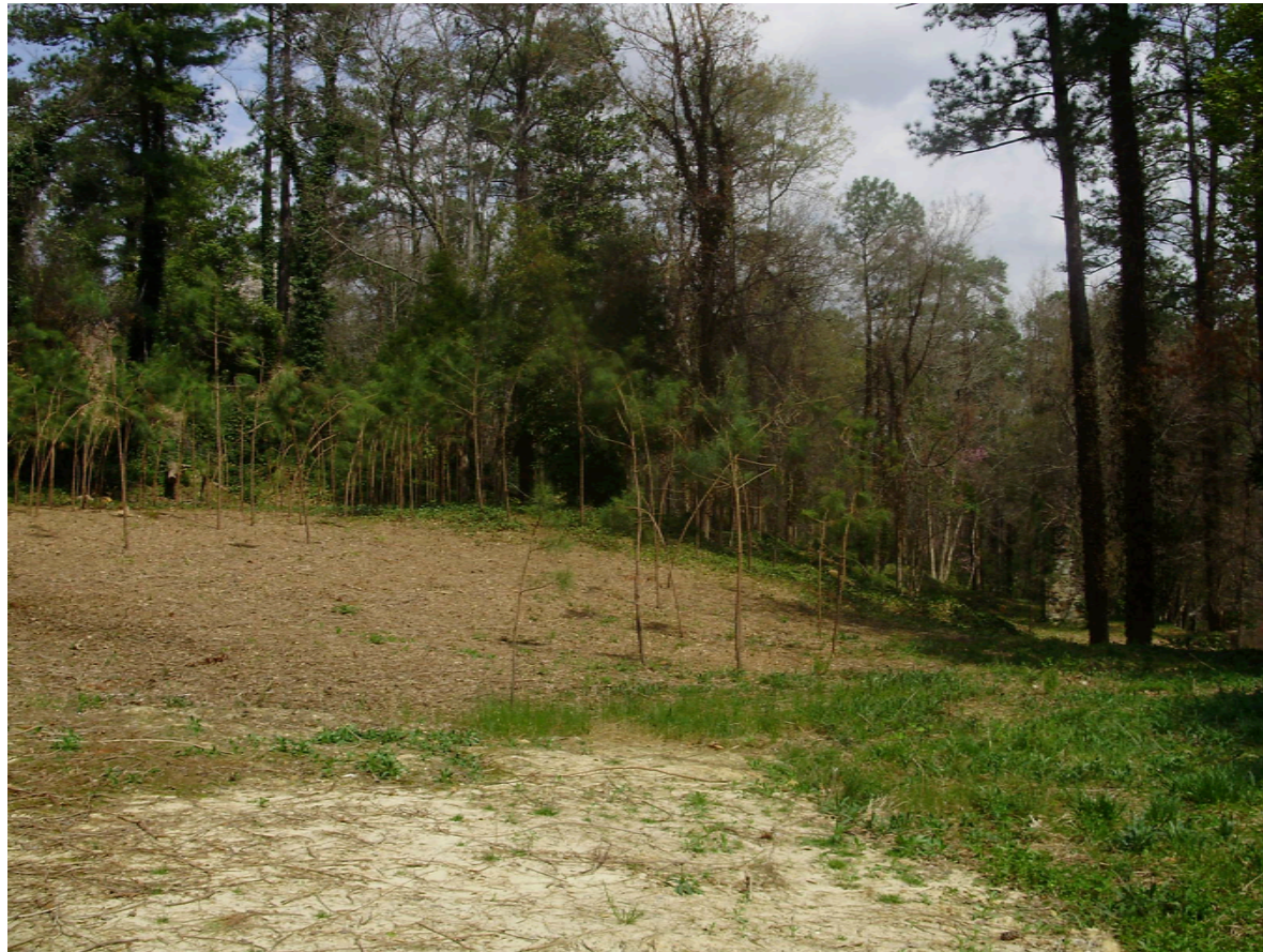
Smith – Ed Castro Landscape (before)

After purchasing the undeveloped 2.8 acre lot adjacent to their home to avoid over development in their neighborhood, our client wanted to restore the environmental health of the overgrown property while providing an inviting space for the entire neighborhood to enjoy. With removal of invasive species, re-grading, development of trails, orchards and meadows we were able to transform the property into a healthy, park-like green space for the homeowners and their neighbors.