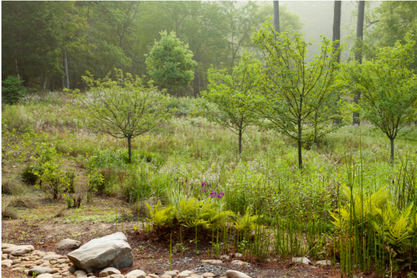
Smith – Ed Castro Landscape

The large amount of water coming into the site was redirected through carefully designed “dry creek beds” into an underground catchment area and wetland rain garden, turning what was once a problem into an asset for both humans and wildlife.