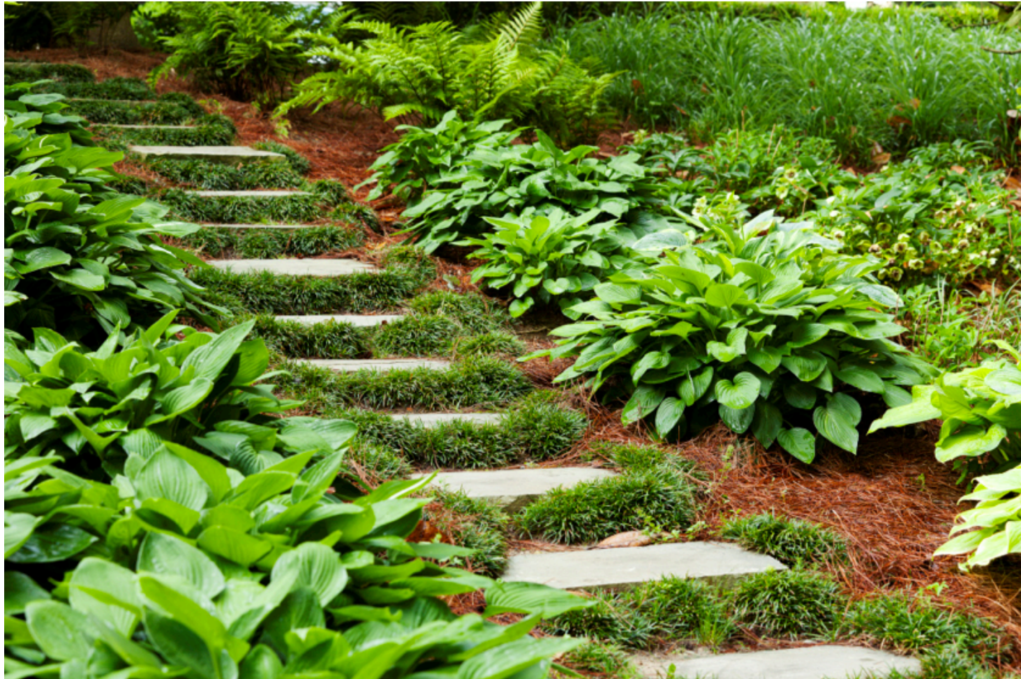
Smith – Ed Castro Landscape

Stone steps guide visitors through an herbaceous shade garden.