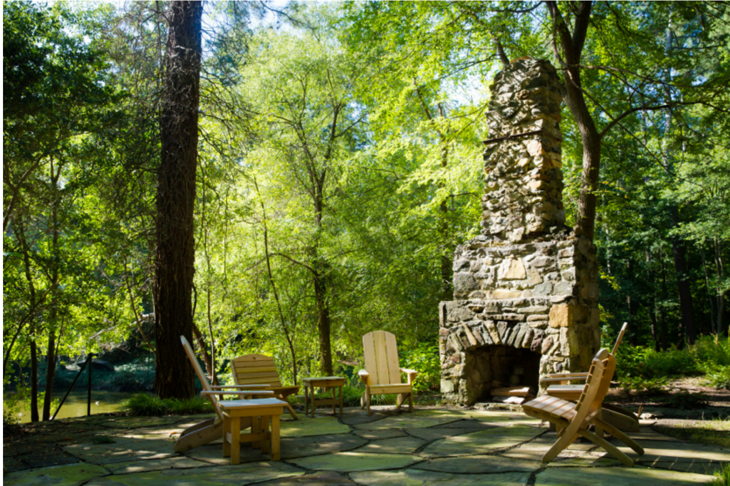
Smith – Ed Castro Landscape

The existing stone fireplace was refurbished and incorporated into a stone seating area that overlooks the lake.