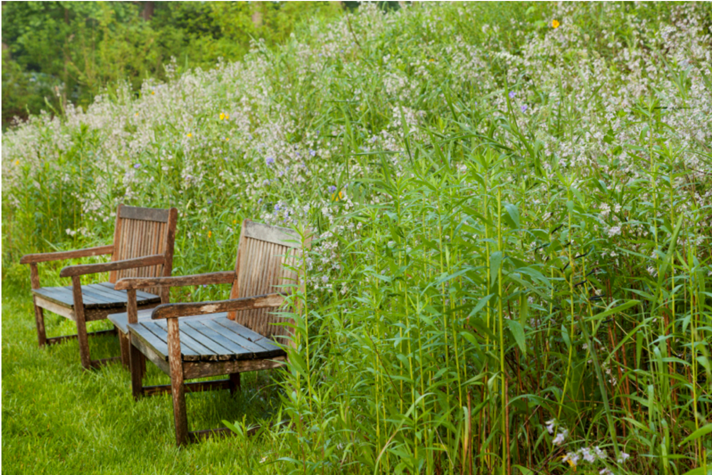
Smith – Ed Castro Landscape

Wooden seating benches along the fescue trail through the meadow provide a quiet spot to rest overlooking the lake.