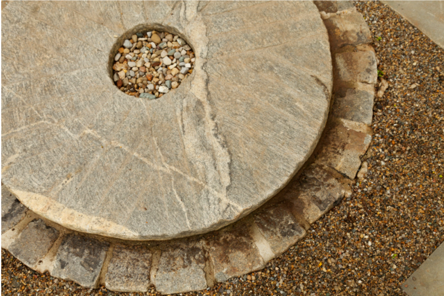
Smith – Ed Castro Landscape

An antique granite millstone detail pays homage to the history of the site.