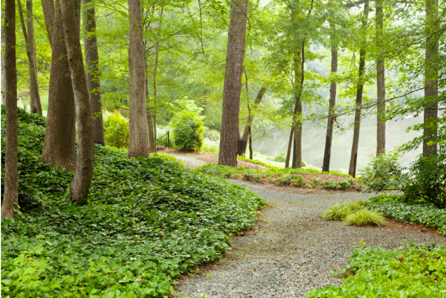
Smith – Ed Castro Landscape

Gravel-based trails meander through the woods and along the lake edge, connecting the residential property, meadow, and historic fireplace gathering area.