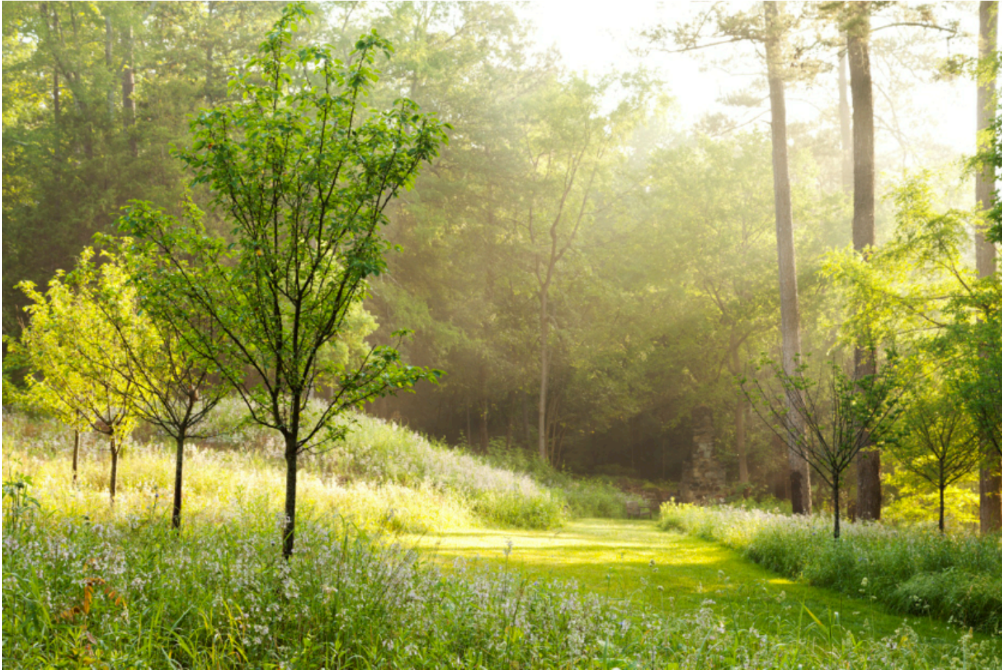
Smith – Ed Castro Landscape

The area was repopulated with native species and attractive wildflowers to create a beautiful meadow.